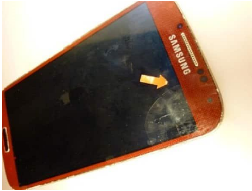
Missing keys or buttons