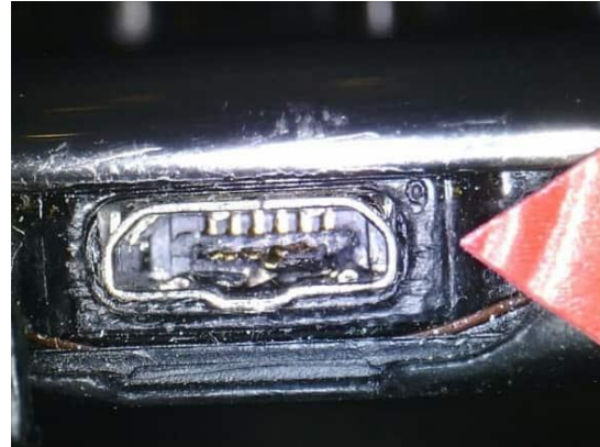
Normal port (covered by warranty)